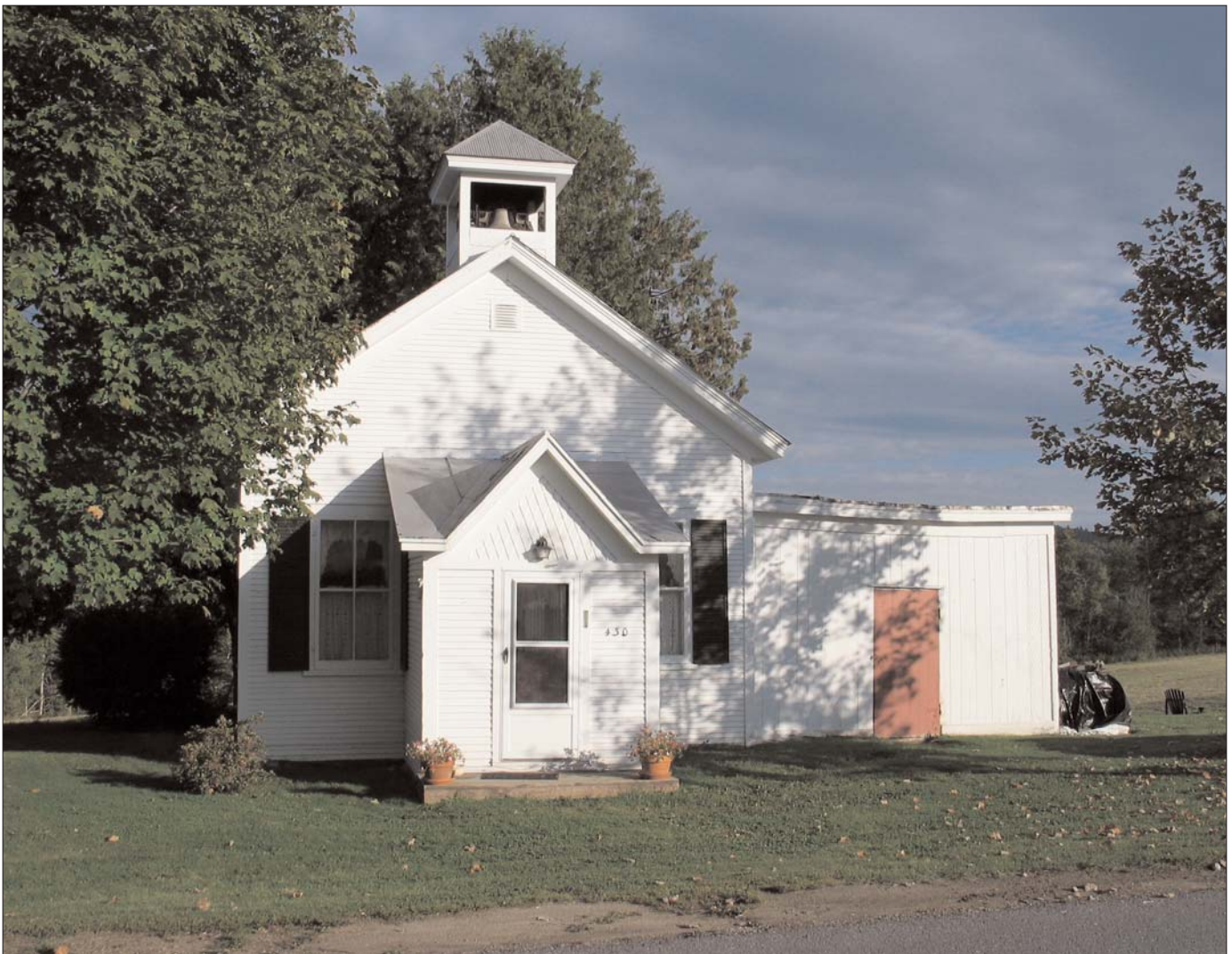
Brainard's Forge Schoolhouse