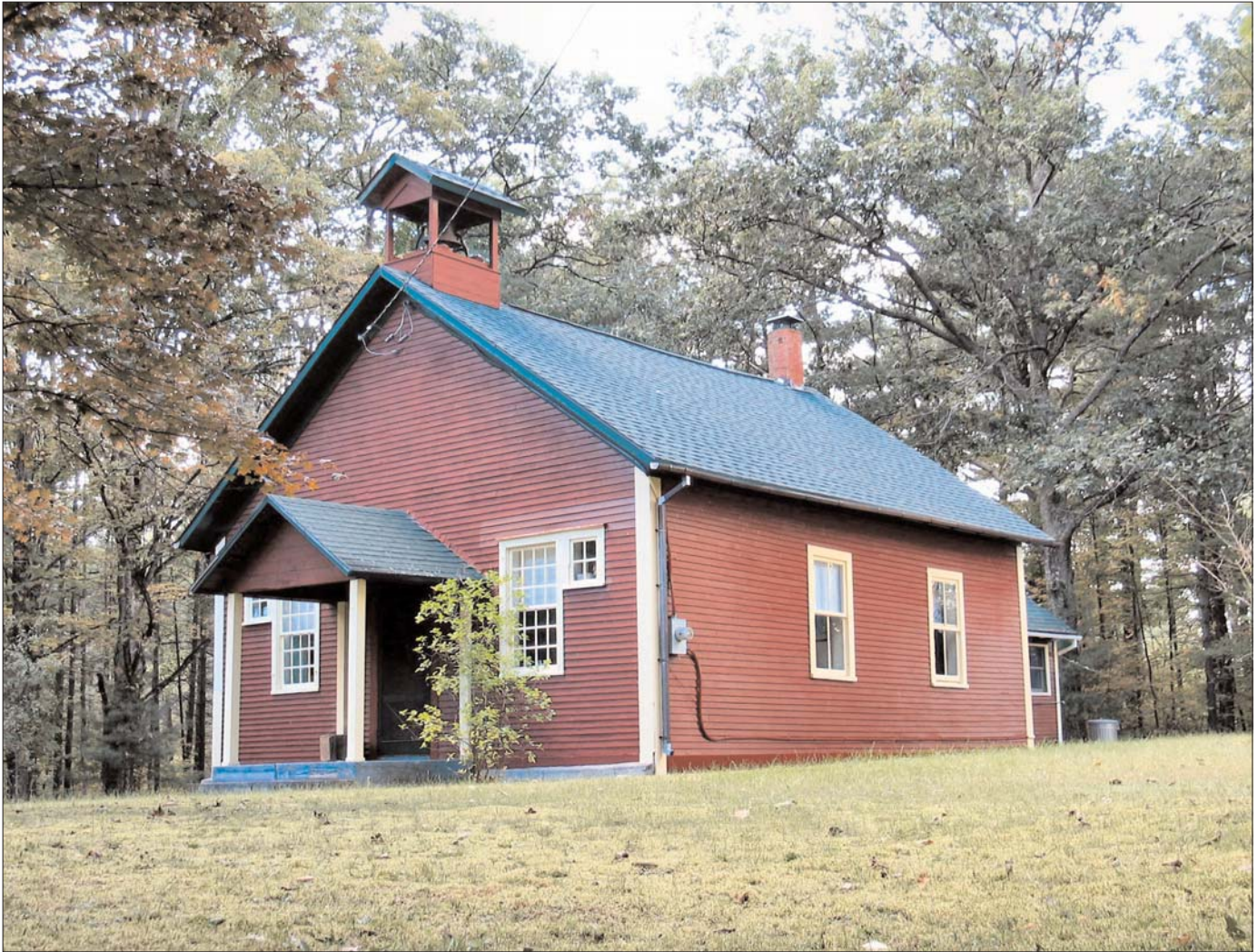
Livingstone Schoolhouse, Lewis's "Little Red Schoolhouse"