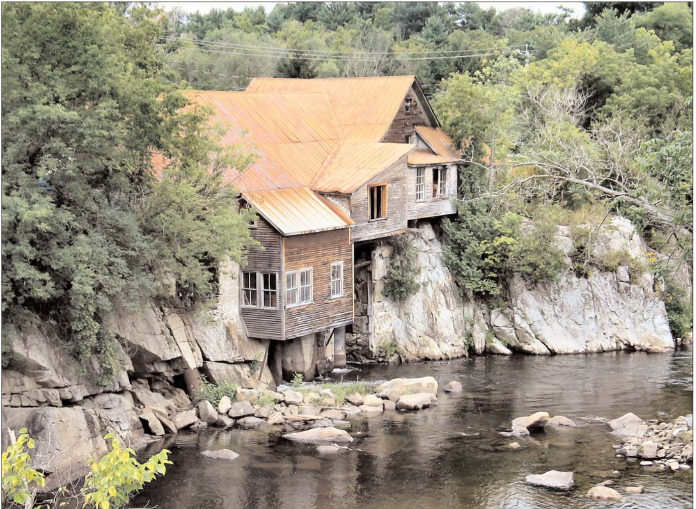
Wadhams' century-old hydroelectric powerhouse, its foundations carved into the living rock of the Boquet River's granite bed.

The central feature of the hamlet today, as it was two centuries ago, is the Wadhams falls, through which the Boquet River roars. The power from those falls drove a sawmill 100 years ago. An artificial channel cut deep into the living rock of the riverbed maximized the mechanical force available for a gristmill, opened in 1802. In 1904, a hydroelectric plant was built in Wadhams, with water from above the falls transported down a huge, above-ground pipe into a powerhouse perched above the river just downstream.