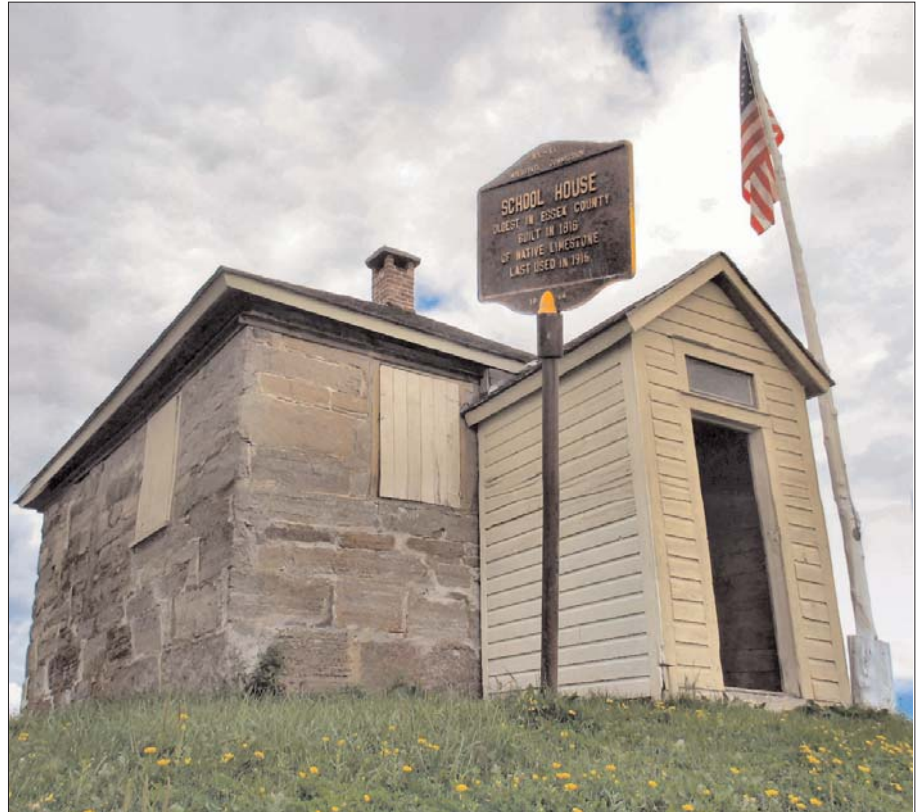
The oldest surviving schoolhouse in Essex County can be found outside Westport village on the Camp Dudley Road. Built in 1816, it was used for a full century.

Ballard Park will also be Ground Zero for this Saturday’s annual Westport Heritage Festival. Activities start at 9 a.m. with a 5-km walk/run. A History Tent will be open all day, and a house tour will guide visitors through the village from noon to 4 p.m. The kids can hitch rides on a horse-drawn carriage from 11 a.m. “till the horse gets tired.” A high tea will be served at the beautiful, stone church on Main Street, with sittings at 2:30 and 4 p.m. Live music will be offered in the afternoon by blues guitarist Joan