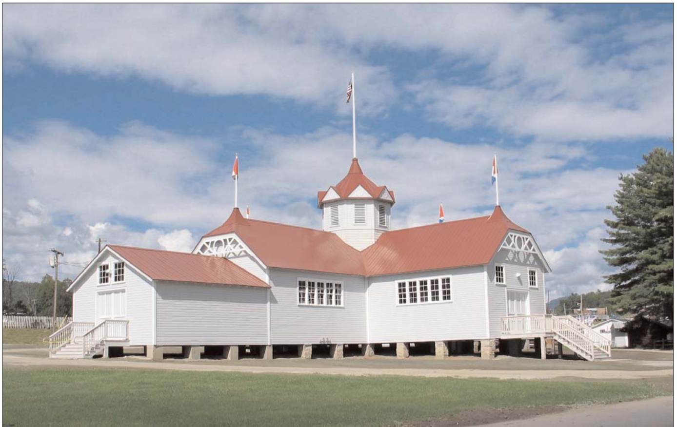
The 1885 Floral Hall is spic and span and ready for this year’s Essex County Fair at the Westport fairgrounds.