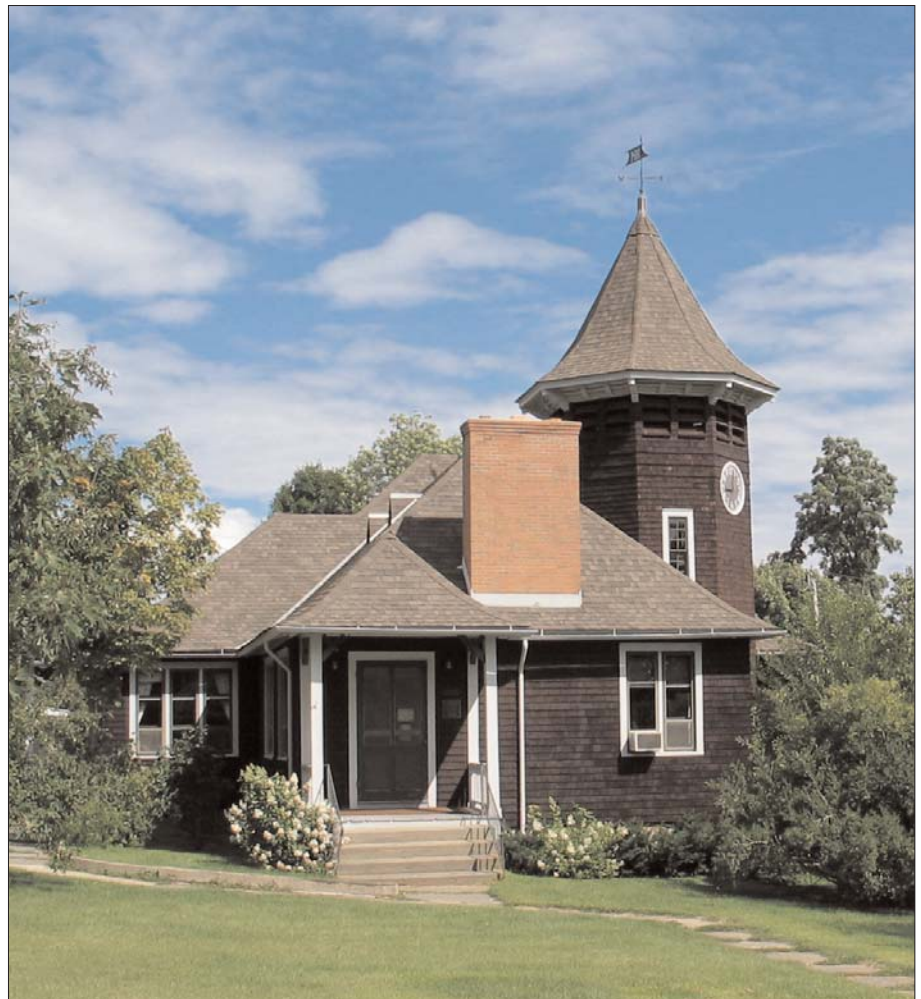
The Westport Library, architectural centerpiece of this beautiful Lake Champlain village, built in 1888. It overlooks Westport's central park.