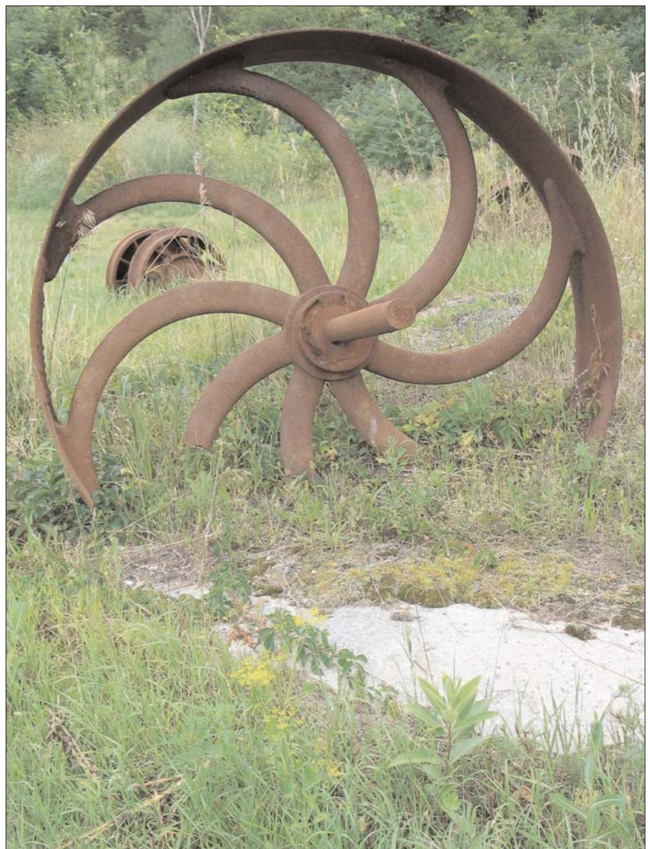
A discarded mechanical power wheel, a remnant of Wadhams’ industrial past, sits in an empty lot next to the hamlet’s waterfalls.