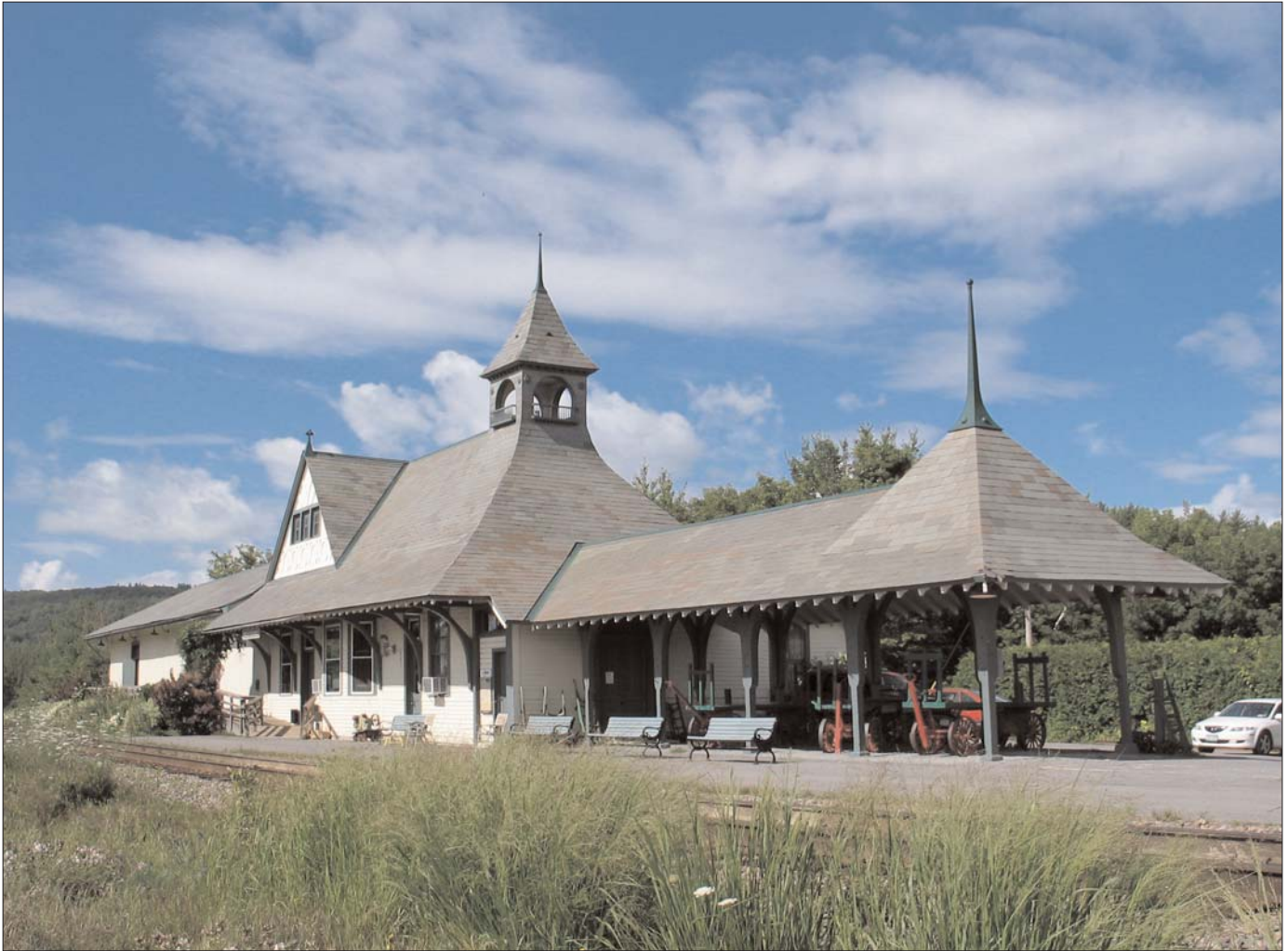
The 1876 D&H Railroad depot in Westport, still a daily stop on the Amtrak run between New York City and Montreal, has been restored for adaptive re-use as the Depot Theater, home of summer stage performances.

stroll by these old homes is how many of them have become small, boutique bed-and-breakfast hostels. While the once-grand Westport Inn was struck down by the same post-1940s decline that hit every other grand Adirondack hotel, from Schroon Lake to Lake Placid and beyond — the Westport Inn site has been transformed into a lakeside outdoor theater called Ballard Park — the customized B&Bs and small inns seem to have really found a niche in Westport.